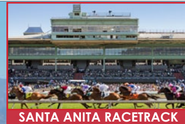
SANTA ANITA RACETRACK