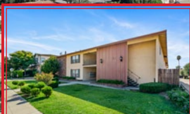
1132 W DUARTE RD