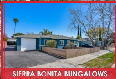
SIERRA BONITA BUNGALOWS