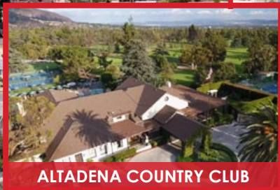
ALTADENA COUNTRY CLUB