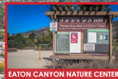
EATON CANYON NATURE CENTER