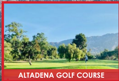
ALTADENA GOLF COURSE