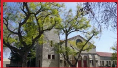
CHRIST CHURCH SIERRA MADRE