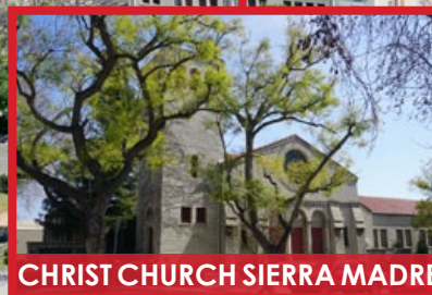
CHRIST CHURCH SIERRA MADRE