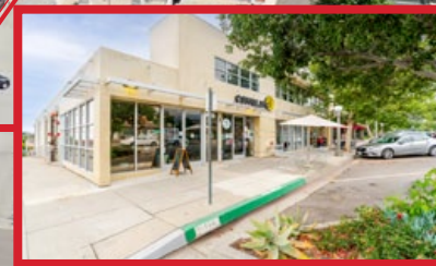
138-140 W SIERRA MADRE BLVD