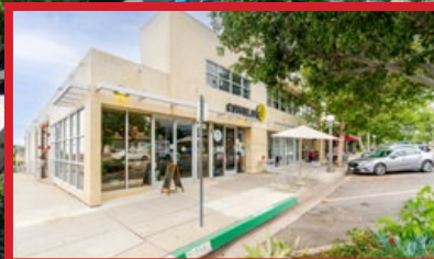
138-140 W SIERRA MADRE BLVD