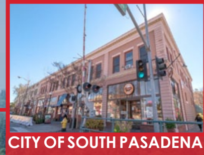
CITY OF SOUTH PASADENA