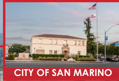
CITY OF SAN MARINO