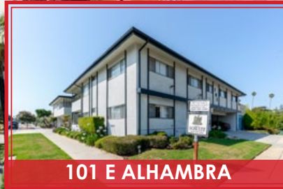
101 E ALHAMBRA