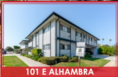
101 E ALHAMBRA