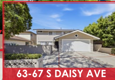
63-67 S DAISY AVE