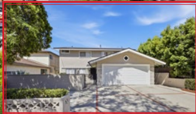
63-67 S DAISY AVE