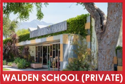
WALDEN SCHOOL (PRIVATE)

MULTI-MILLION DOLLAR RESIDENTIAL NEIGHBORHOOD