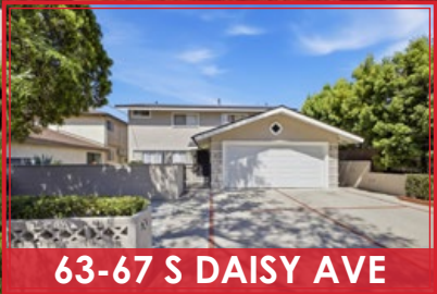
63-67 S DAISY AVE