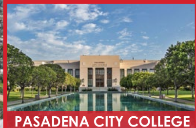
PASADENA CITY COLLEGE