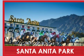
SANTA ANITA PARK