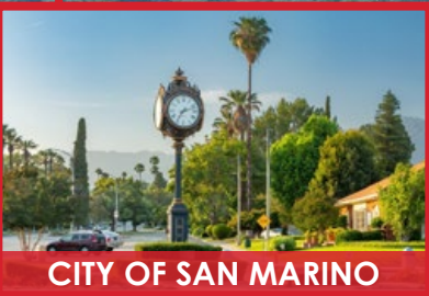
CITY OF SAN MARINO