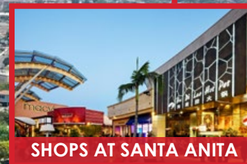
SHOPS AT SANTA ANITA