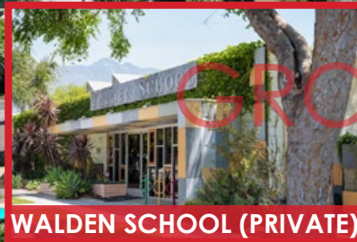
WALDEN SCHOOL (PRIVATE)