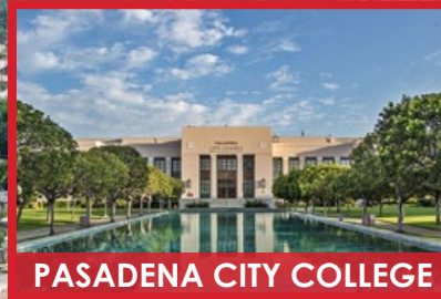
PASADENA CITY COLLEGE