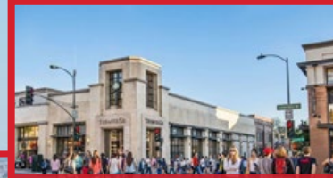
OLD TOWN PASADENA