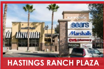
HASTINGS RANCH PLAZA