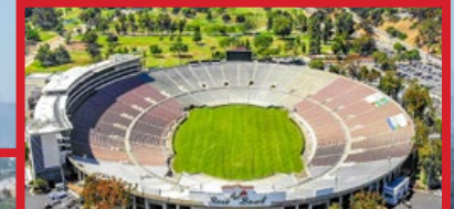
ROSE BOWL AREA