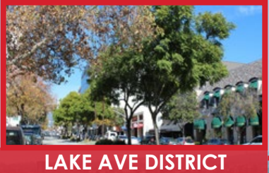
LAKE AVE DISTRICT