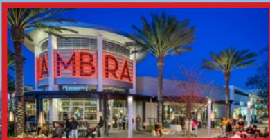
CITY OF ALHAMBRA