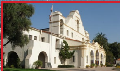
CITY OF SAN GABRIEL