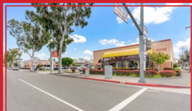
9000 GARVEY AVE

GARVEY AVE - TRAFFIC COUNT: \pm 23,705 CPD